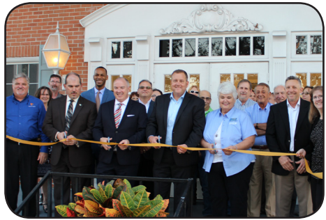
Grand Opening and Ribbon Cutting at the West Pasco Entrepreneur Center

Off-site Members: 4 On-site Members: 4 Total Jobs Created FY18*: 34