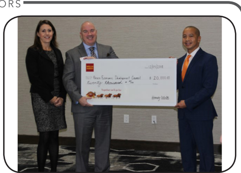
Wells Fargo Microloan Donation