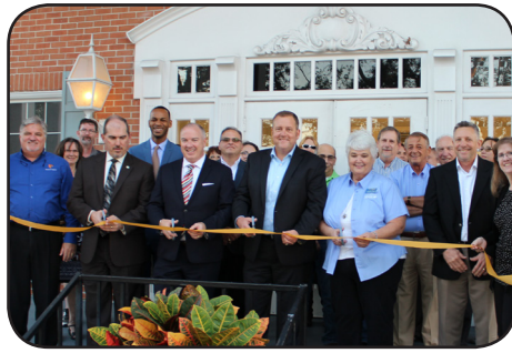
Grand Opening and Ribbon Cutting at the West Pasco Entrepreneur Center