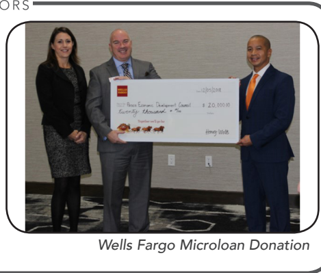
Wells Fargo Microloan Donation

Off-site Members: 3 On-site Members: 7 Total Jobs Created FY19*: 46 *Including exited members