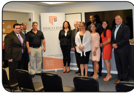
Central and West Pasco CO.STARTERS Graduation