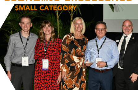
JTD ENTERPRISES, INC.