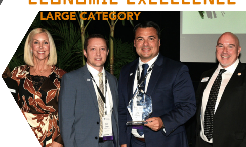
TRU SIMULATION + TRAINING